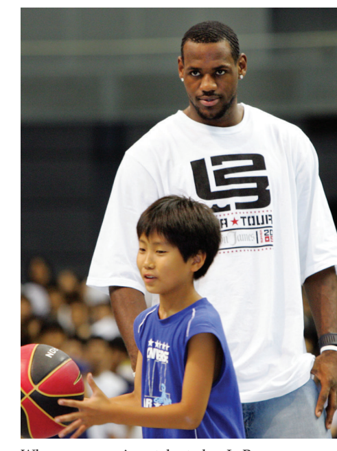
When someone is as talented as LeBron James, it makes sense for others to try to imitate him—and young children often do just that, they mimic LeBron and other talented people.