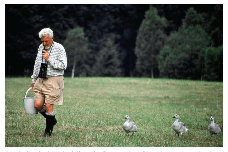
Newly hatched chicks follow the first moving object they see, treating it as "Mother" even when it's a human.

One well-known example of a critical period comes from the work of Konrad Lorenz (1903–1989), a zoologist who noticed that newly hatched chicks follow their mother. He theorized that chicks are biologically programmed to follow the first moving object that they see. Usually this was the mother, so following her was the